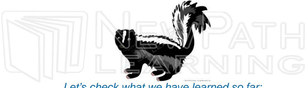
Let's check what we have learned so far: Name one type of animal adaptation.

A skunk uses its bad odor to keep animals that might hurt it away from it!