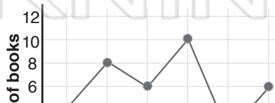
Books borrowed from library