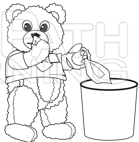
throw away tissues