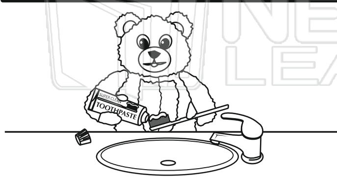
Brush your teeth.