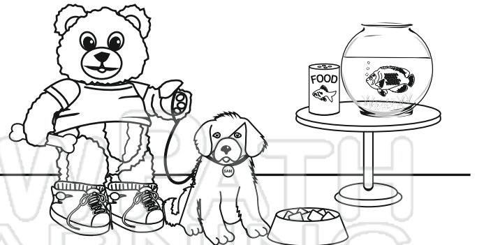
Take care of pets.