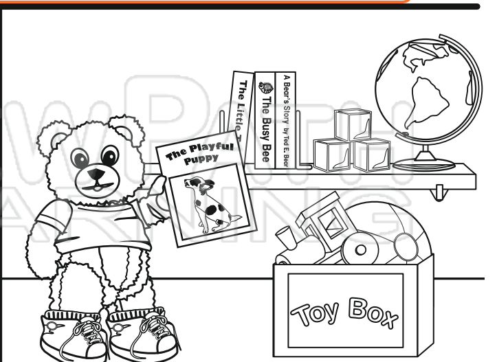
Put things away.