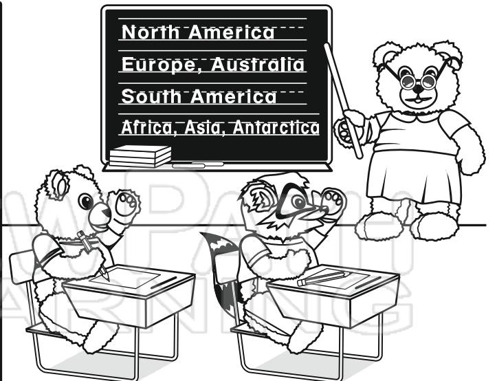
Raise your hand to speak.